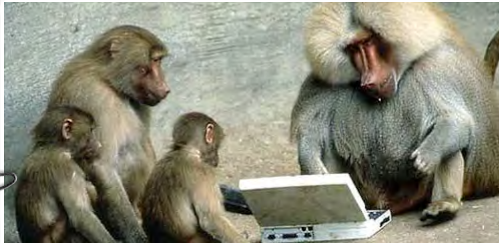
So easy a monkey can...well, you know.