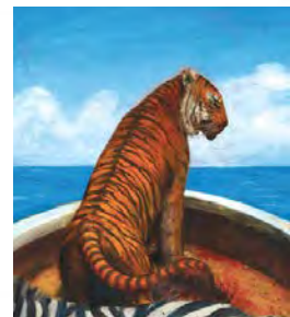
A tiger on a lifeboat!